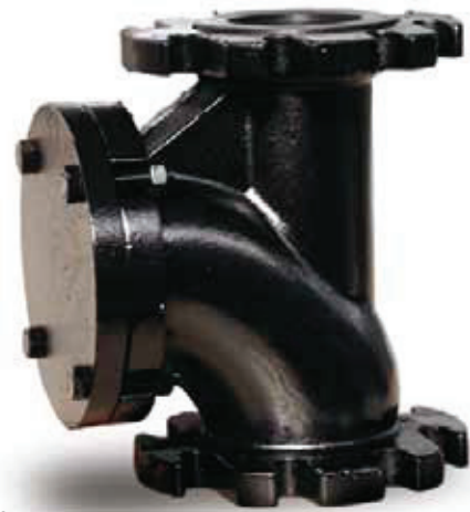
All product images are indicative only

The indication PN refers to the flange and not to the maximum operating pressure.